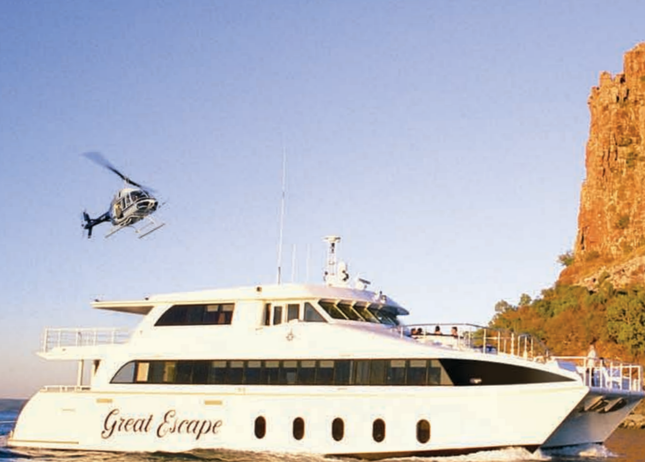
The Kimberley in north-west Western Australia has it all: pristine landscapes, rich biodiversity and ancient heritage.