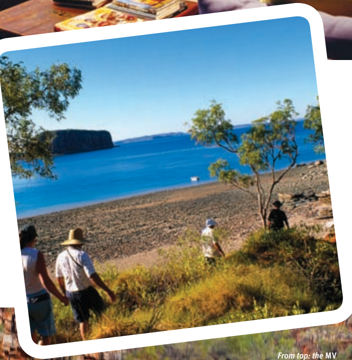
From top: the MV Great Escape is decked out in informal luxury; Disembark and explore terra firma; Take a dip in the freshwater pool at Melaleuca Falls.