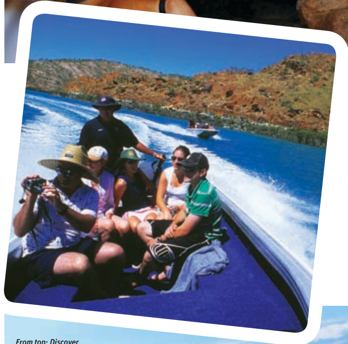
From top: Discover ancient rock art; Take a guided tour on one of the catamaran's tenders; Marine life is abundant in the bays.